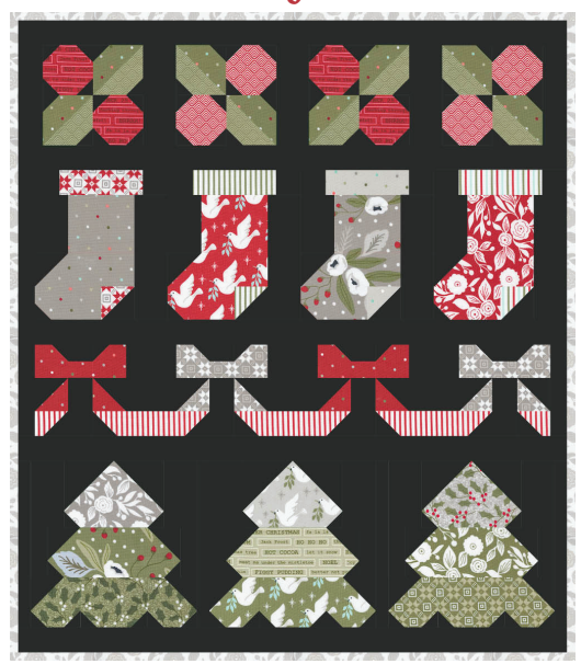
Finished size: 33 1/2" x 38 1/2"